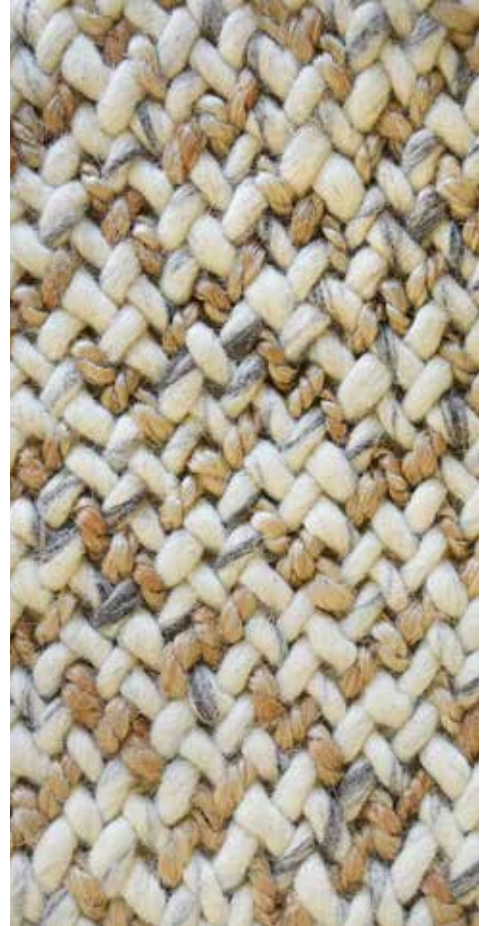
C3-001 White Honey