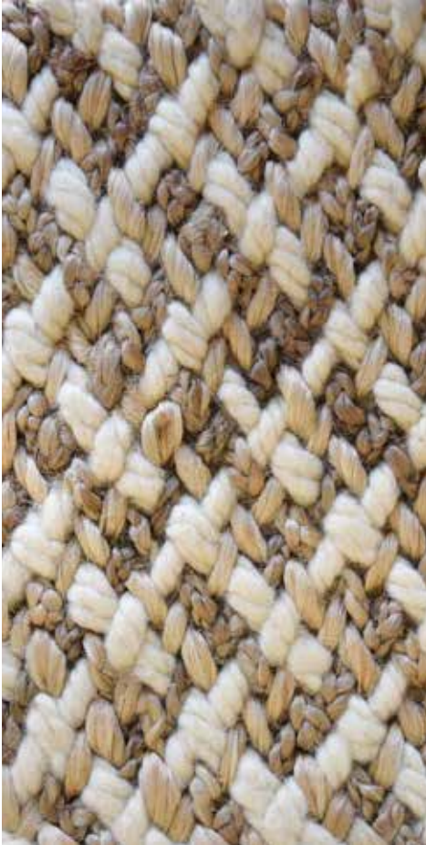
C1-001 White Sand